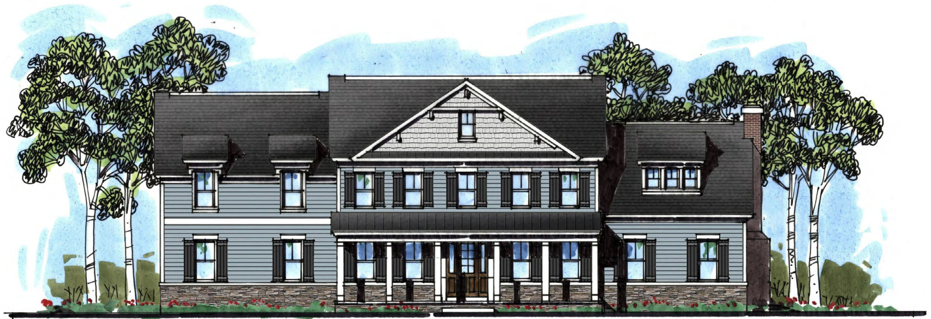
FRONT ELEVATION SHOWN w/ STONE, SHAKE & SIDING